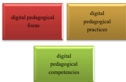
Fig. 1. Measuring digital pedagogy

It is now proposed to conceptualize the dimensions of digital pedagogy (Väättäjä & Ruokamo, 2018) as a new form of the pedagogical cluster (see Figure 1).